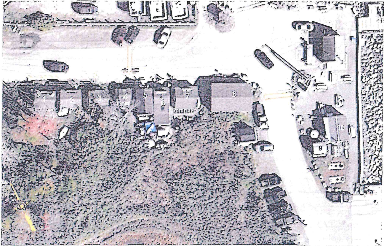
EXHIBIT A - RYE HARBOR RIGHT OF ENTRY OVERVIEW AERIAL IMAGE